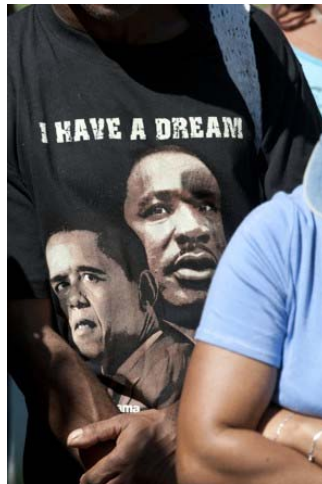
Hundreds attend the first public viewing of the Martin Luther King Junior Memorial in Washington, D.C. on August 22, 2011.

"Dr. King died dealing with economic inequality in this country, which we are still dealing with to this day," said Sharpton, who is slated to speak during the dedication. "Where we will be for his memorial is where he wanted to build Resurrection City as part of the Poor People's Campaign." The campaign was the last major movement King organized before his assassination.